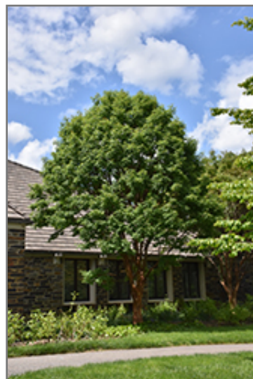
Paperbark Maple