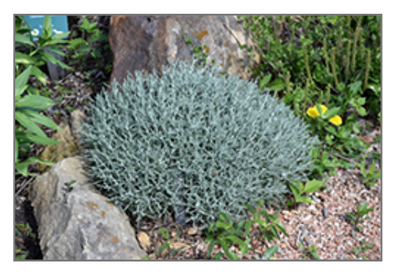
Cotton Lavender