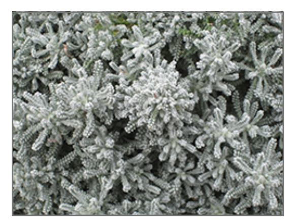
Cotton Lavender foliage

Cotton Lavender will grow to be about 18 inches tall at maturity, with a spread of 24 inches. It has a low canopy. It grows at a medium rate, and under ideal conditions can be expected to live for approximately 10 years.