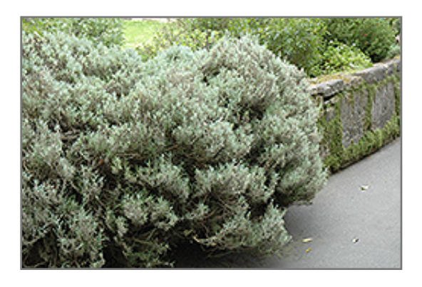
Cotton Lavender

This shrub will require occasional maintenance and upkeep, and should only be pruned after flowering to avoid removing any of the current season's flowers. It is a good choice for attracting butterflies to your yard, but is not particularly attractive to deer who tend to leave it alone in favor of tastier treats. It has no significant negative characteristics.