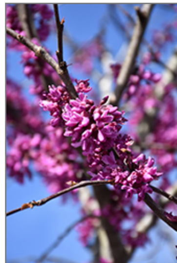
Eastern Redbud (tree form) flowers