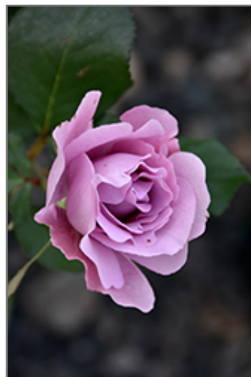
Angel Face Rose flowers