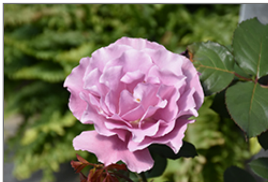
Angel Face Rose flowers