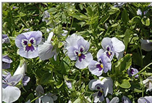
Panola Marina Pansy flowers