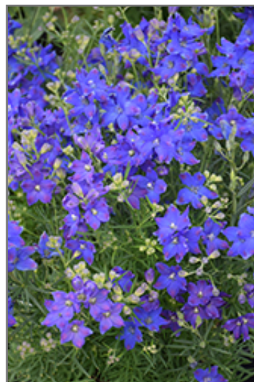
Diamonds Blue Delphinium flowers

Diamonds Blue Delphinium is recommended for the following landscape applications;