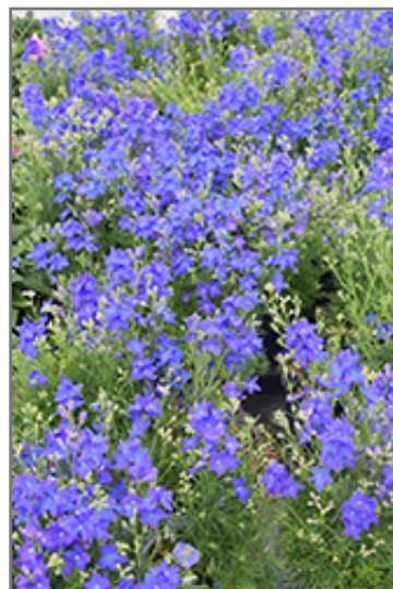
Diamonds Blue Delphinium in bloom

Diamonds Blue Delphinium is a fine choice for the garden, but it is also a good selection for planting in outdoor pots and containers. It can be used either as 'filler' or as a 'thriller' in the 'spiller-thriller-filler' container combination, depending on the height and form of the other plants used in the container planting. Note that when growing plants in outdoor containers and baskets, they may require more frequent waterings than they would in the yard or garden.