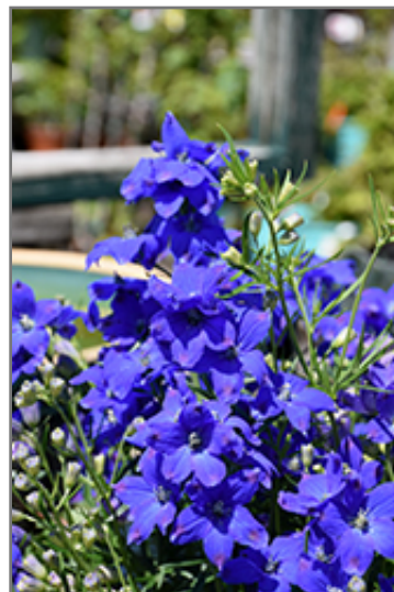
Diamonds Blue Delphinium flowers