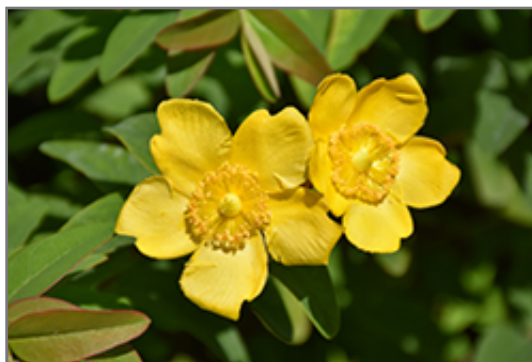
Sungold St. John's Wort flowers