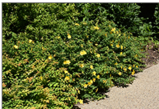
Sungold St. John's Wort in bloom