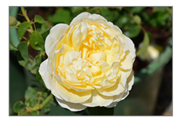
Charlotte Rose flowers