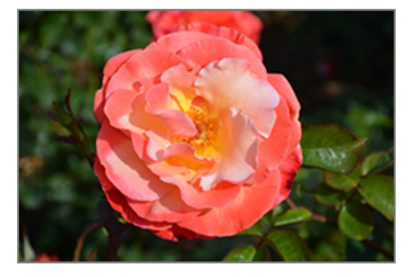
Colorific Rose flowers

A real showstopper, this rose produces striking blooms of peach, coral, and salmon, that mature to deeper tones of orange, scarlet and burgundy; impressive when massed in the garden; blooms repeat all season long and make splendid cut flowers