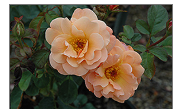
Colorific Rose flowers

Colorific Rose is recommended for the following landscape applications;