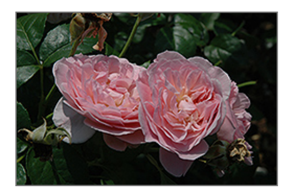
Strawberry Hill Rose flowers