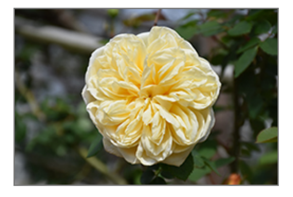
Teasing Georgia Rose flowers