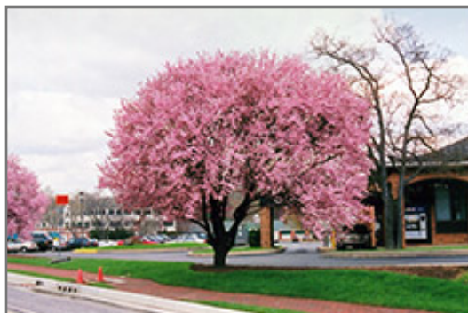
Thundercloud Plum in bloom