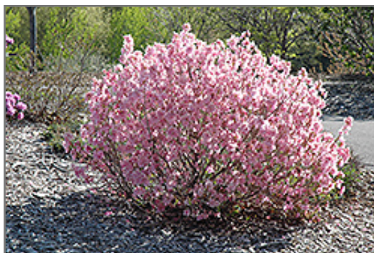
Cornell Pink Rhododendron in bloom