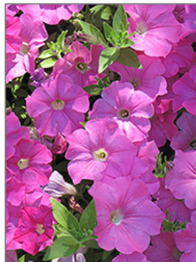
Easy Wave Pink Petunia flowers

This plant will require occasional maintenance and upkeep. Trim off the flower heads after they fade and die to encourage more blooms late into the season. It is a good choice for attracting hummingbirds to your yard, but is not particularly attractive to deer who tend to leave it alone in favor of tastier treats. It has no significant negative characteristics.