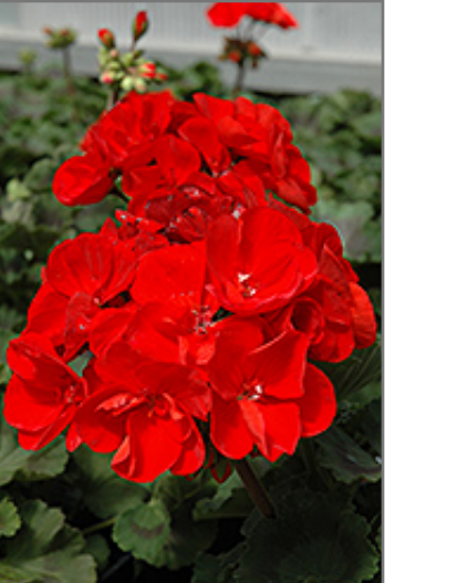
Tango Geranium flowers

Tango Geranium will grow to be about 24 inches tall at maturity, with a spread of 24 inches. When grown in masses or used as a bedding plant, individual plants should be spaced approximately 16 inches apart. Its foliage tends to remain dense right to the ground, not requiring facer plants in front. Although it's not a true annual, this fast-growing plant can be expected to behave as an annual in our climate if left outdoors over the winter, usually needing replacement the following year. As such, gardeners should take into consideration that it will perform differently than it would in its native habitat.