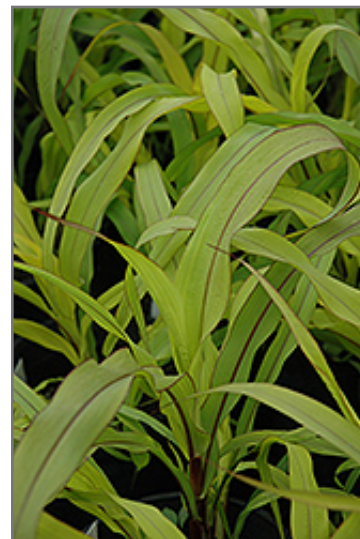
Jester Millet foliage