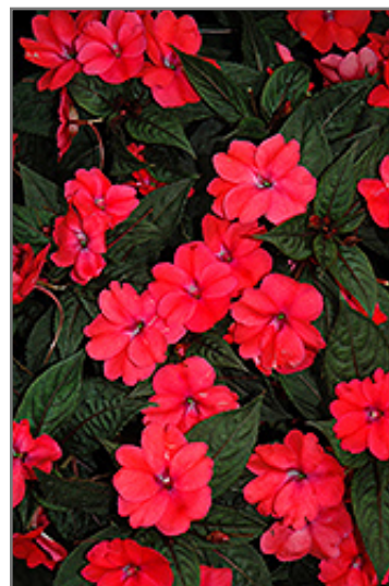
SunPatiens Compact Deep Rose New Guinea Impatiens flowers

This plant will require occasional maintenance and upkeep, and should not require much pruning, except when necessary, such as to remove dieback. It is a good choice for attracting bees and butterflies to your yard. It has no significant negative characteristics.