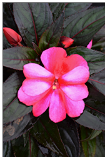
Sonic Sweet Purple New Guinea Impatiens flowers

Sonic Sweet Purple New Guinea Impatiens is recommended for the following landscape applications;