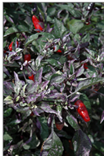
Calico Ornamental Pepper fruit