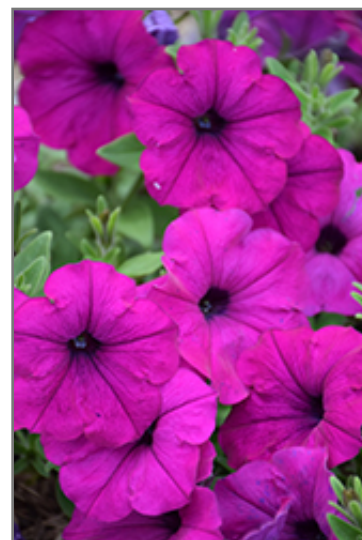
Easy Wave Violet Petunia flowers