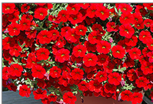
Cabaret Bright Red Calibrachoa flowers

This plant will require occasional maintenance and upkeep. Trim off the flower heads after they fade and die to encourage more blooms late into the season. It is a good choice for attracting bees and hummingbirds to your yard, but is not particularly attractive to deer who tend to leave it alone in favor of tastier treats. It has no significant negative characteristics.