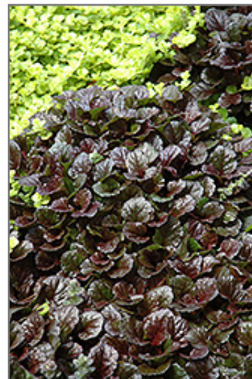
Black Scallop Bugleweed