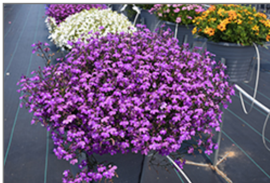
Techno Violet Lobelia in bloom