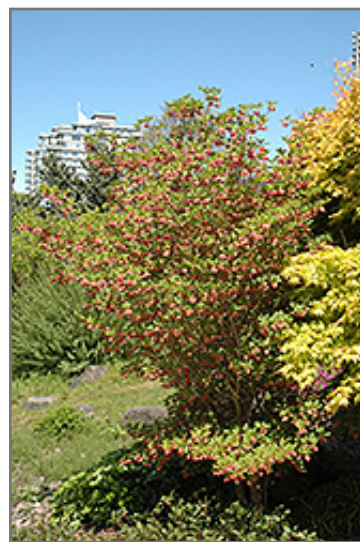
Redvein Enkianthus in bloom