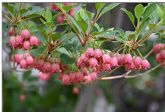
Redvein Enkianthus flowers