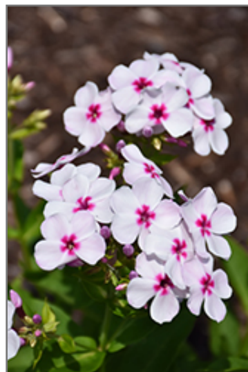
Flame White Eye Garden Phlox flowers

Flame White Eye Garden Phlox is a fine choice for the garden, but it is also a good selection for planting in outdoor pots and containers. With its upright habit of growth, it is best suited for use as a 'thriller' in the 'spiller-thriller-filler' container combination; plant it near the center of the pot, surrounded by smaller plants and those that spill over the edges. Note that when growing plants in outdoor containers and baskets, they may require more frequent waterings than they would in the yard or garden.