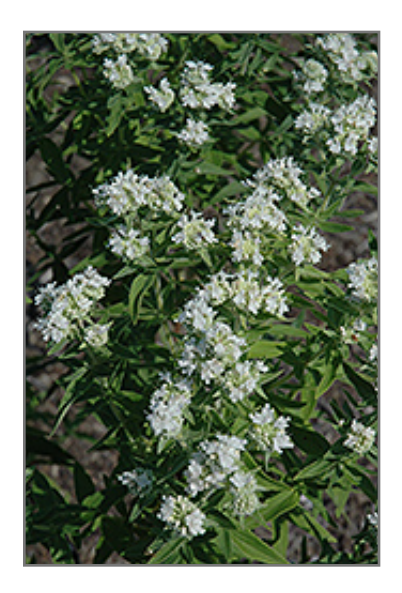
Hairy Mountain Mint in bloom