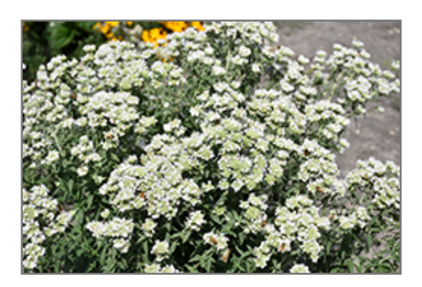
Hairy Mountain Mint flowers

Hairy Mountain Mint is recommended for the following landscape applications;