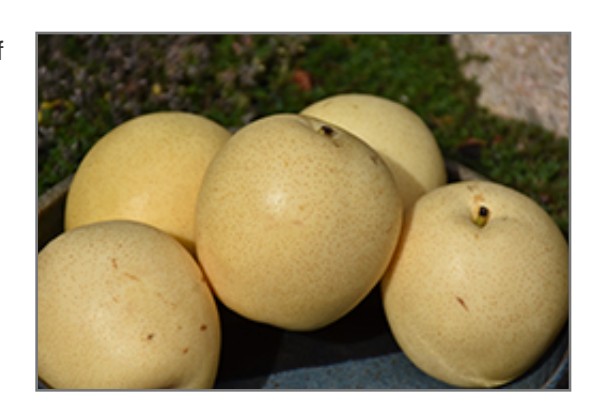
Shinseiki Asian Pear fruit

This tree is typically grown in a designated area of the yard because of its mature size and spread. It should only be grown in full sunlight. It does best in average to evenly moist conditions, but will not tolerate standing water. It is not particular as to soil type or pH. It is highly tolerant of urban pollution and will even thrive in inner city environments. This is a selected variety of a species not originally from North America.