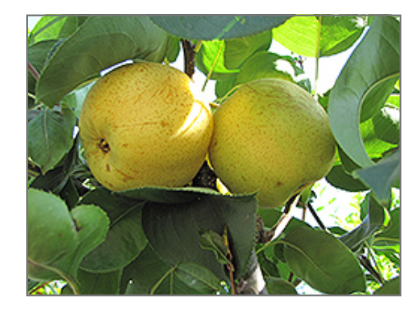
Shinseiki Asian Pear fruit

Shinseiki Asian Pear is clothed in stunning clusters of white flowers with pink anthers along the branches in early spring before the leaves. It has dark green deciduous foliage. The glossy pointy leaves turn an outstanding tomato-orange in the fall. The fruits are showy yellow pears carried in abundance in late summer. The fruit can be messy if allowed to drop on the lawn or walkways, and may require occasional clean-up.