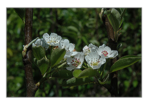
Shinseiki Asian Pear flowers