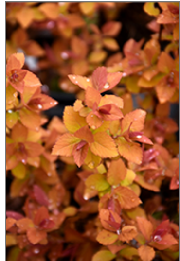
Double Play Big Bang Spirea foliage

This shrub should only be grown in full sunlight. It prefers to grow in average to moist conditions, and shouldn't be allowed to dry out. It is not particular as to soil type or pH. It is highly tolerant of urban pollution and will even thrive in inner city environments. This particular variety is an interspecific hybrid.