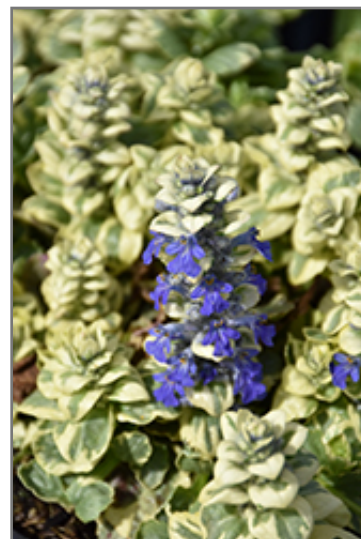
Silver Queen Bugleweed flowers

Silver Queen Bugleweed is a dense herbaceous evergreen perennial with a ground-hugging habit of growth. Its medium texture blends into the garden, but can always be balanced by a couple of finer or coarser plants for an effective composition.