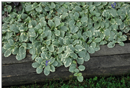
Silver Queen Bugleweed