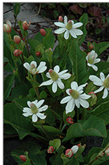
Yerba Mansa flowers

Yerba Mansa is ideally suited for growing in a pond, water garden or patio water container, and is recommended for the following landscape applications;