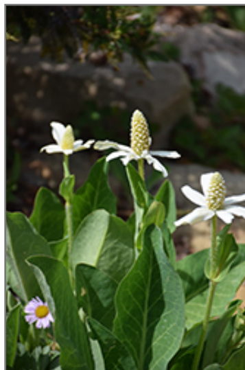
Yerba Mansa flowers