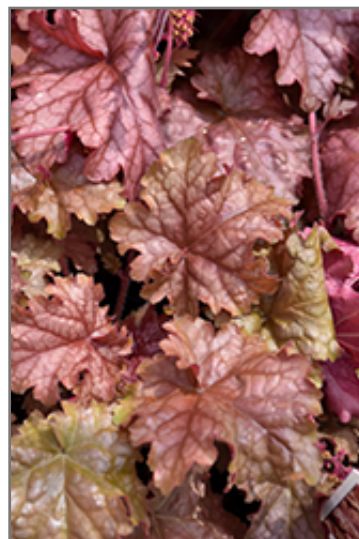
Carnival Peach Parfait Coral Bells foliage

Carnival Peach Parfait Coral Bells is recommended for the following landscape applications;