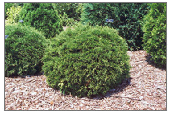
Hetz Midget Arborvitae

A compact, ball-shaped evergreen shrub, very slow growing, excellent for garden detail use and for rock gardens; hardy and adaptable, best with adequate sun, protect from drying winds