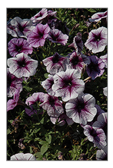
Purple Vein Ray Petunia flowers

Purple Vein Ray Petunia will grow to be about 10 inches tall at maturity, with a spread of 12 inches. When grown in masses or used as a bedding plant, individual plants should be spaced approximately 10 inches apart. Its foliage tends to remain low and dense right to the ground. This fast-growing annual will normally live for one full growing season, needing replacement the following year.