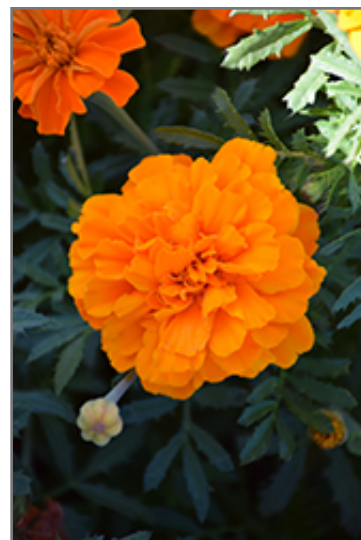
Safari Tangerine Marigold flowers