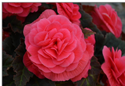
Nonstop Mocca Pink Shades Begonia flowers