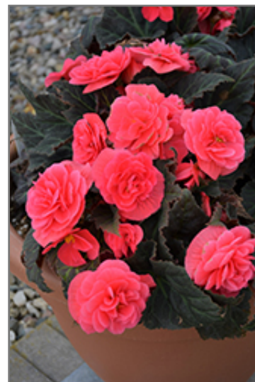
Nonstop Mocca Pink Shades Begonia in bloom

This is a high maintenance plant that will require regular care and upkeep, and usually looks its best without pruning, although it will tolerate pruning. Deer don't particularly care for this plant and will usually leave it alone in favor of tastier treats. Gardeners should be aware of the following characteristic(s) that may warrant special consideration;