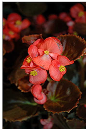
Nightife Red Begonia flowers

This is a high maintenance plant that will require regular care and upkeep, and usually looks its best without pruning, although it will tolerate pruning. Deer don't particularly care for this plant and will usually leave it alone in favor of tastier treats. Gardeners should be aware of the following characteristic(s) that may warrant special consideration;