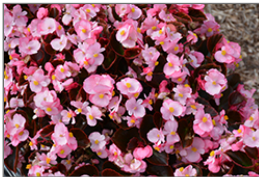
Nightife Pink Begonia flowers