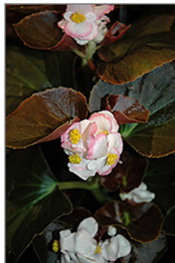
Nightife Blush Begonia flowers

This is a high maintenance plant that will require regular care and upkeep, and usually looks its best without pruning, although it will tolerate pruning. Deer don't particularly care for this plant and will usually leave it alone in favor of tastier treats. Gardeners should be aware of the following characteristic(s) that may warrant special consideration;