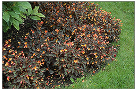
Sparks Will Fly Begonia in bloom