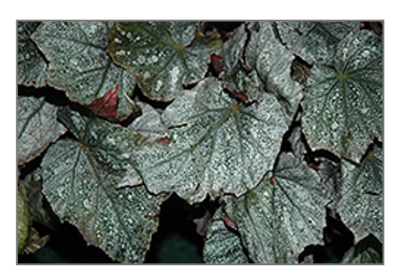
Shadow King Cool White Begonia foliage

Shadow King Cool White Begonia is recommended for the following landscape applications;