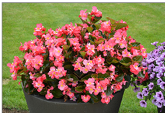
Surefire Rose Begonia in bloom