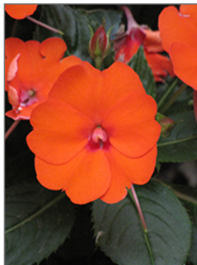
SunPatiens Compact Electric Orange New Guinea Impatiens flowers

This plant will require occasional maintenance and upkeep, and should not require much pruning, except when necessary, such as to remove dieback. It is a good choice for attracting bees and butterflies to your yard. It has no significant negative characteristics.