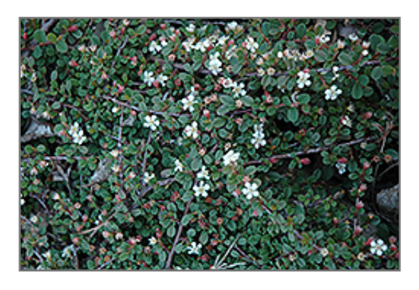
Streib's Findling Cotoneaster flowers

Streib's Findling Cotoneaster is primarily grown for its highly ornamental fruit. It features an abundance of magnificent red berries from late summer to late fall. It features tiny clusters of white flowers along the branches in late spring. It has bluish-green evergreen foliage. The small glossy oval leaves turn an outstanding brick red in the fall, which persists throughout the winter.