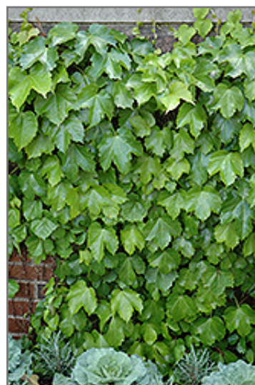
Veitch Boston Ivy