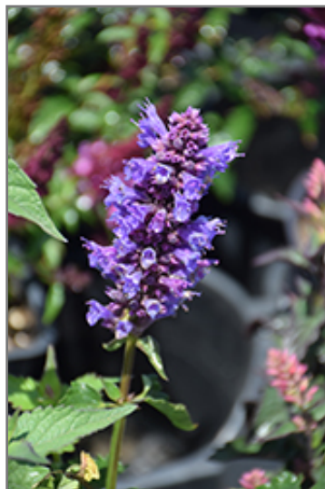
Blue Boa Hyssop flowers