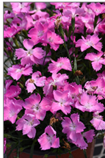
Beauties Kahori Pink Pinks flowers