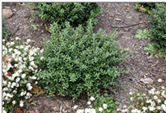
Soft Touch Japanese Holly