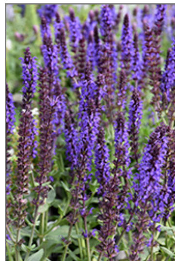
Lyrical Blues Meadow Sage flowers

This is a relatively low maintenance plant, and is best cleaned up in early spring before it resumes active growth for the season. It is a good choice for attracting butterflies and hummingbirds to your yard, but is not particularly attractive to deer who tend to leave it alone in favor of tastier treats. It has no significant negative characteristics.