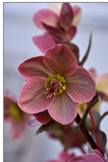
Merlin Hellebore flowers

This is a relatively low maintenance plant, and should be cut back in late fall in preparation for winter. Deer don't particularly care for this plant and will usually leave it alone in favor of tastier treats. It has no significant negative characteristics.