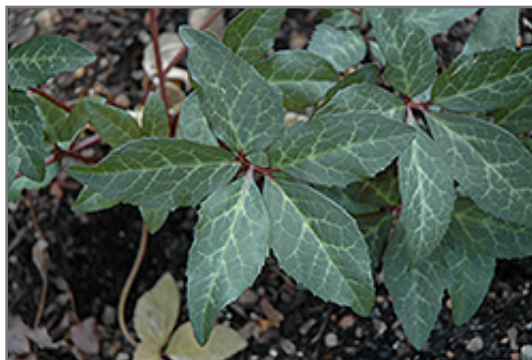
Merlin Hellebore foliage