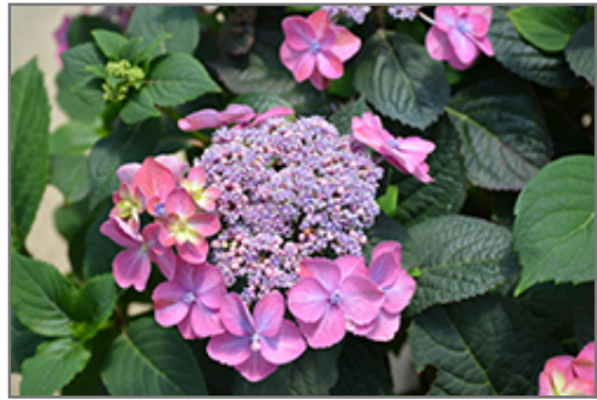
Tuff Stuff Hydrangea flowers

Tuff Stuff Hydrangea makes a fine choice for the outdoor landscape, but it is also well-suited for use in outdoor pots and containers. With its upright habit of growth, it is best suited for use as a 'thriller' in the 'spiller-thriller-filler' container combination; plant it near the center of the pot, surrounded by smaller plants and those that spill over the edges. It is even sizeable enough that it can be grown alone in a suitable container. Note that when grown in a container, it may not perform exactly as indicated on the tag - this is to be expected. Also note that when growing plants in outdoor containers and baskets, they may require more frequent waterings than they would in the yard or garden.