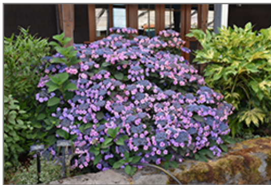
Tuff Stuff Hydrangea in bloom