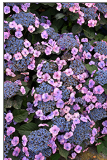
Tuff Stuff Hydrangea flowers

Tuff Stuff Hydrangea is recommended for the following landscape applications;